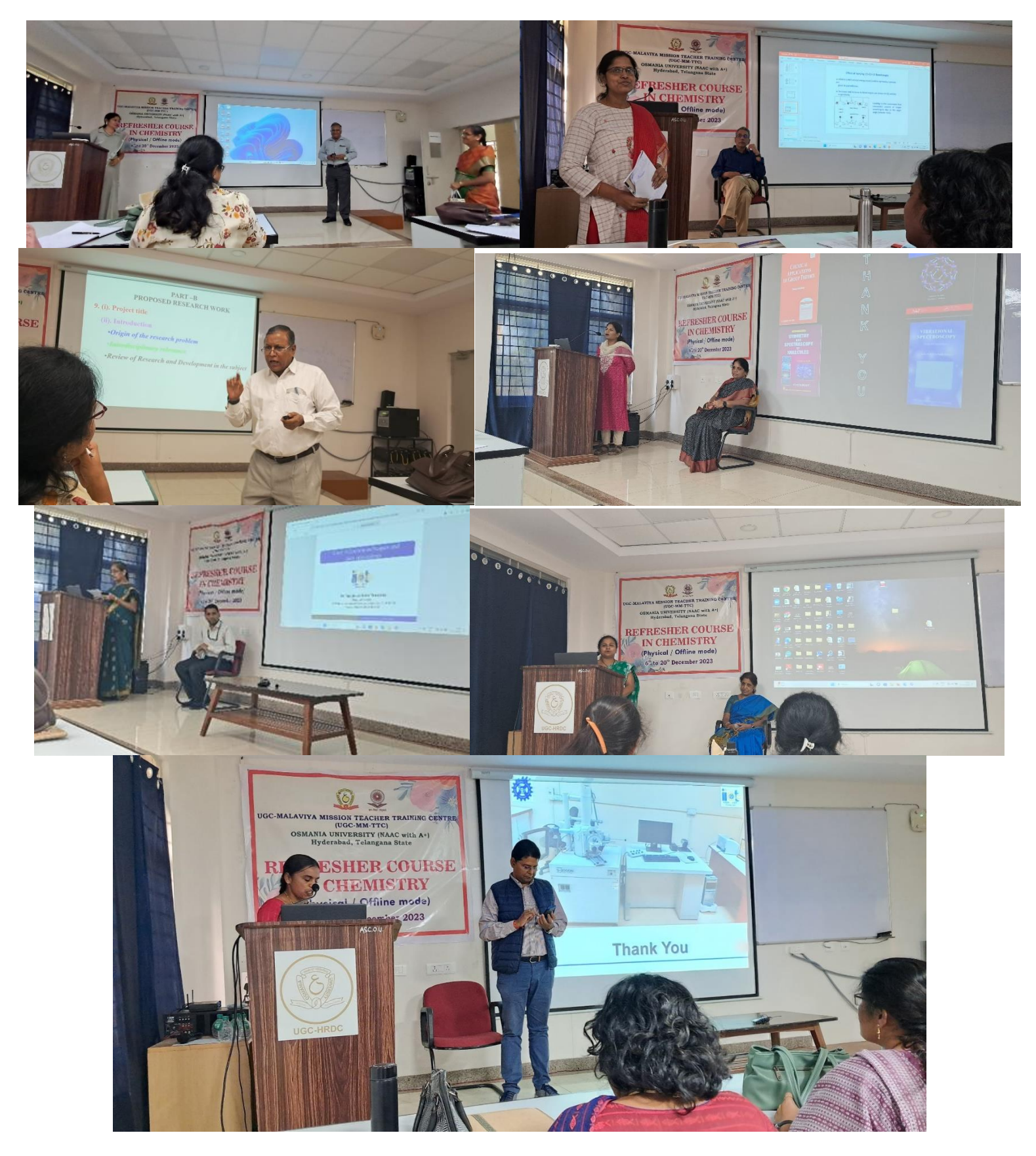
A GLIMPSE OF FEW TALKS