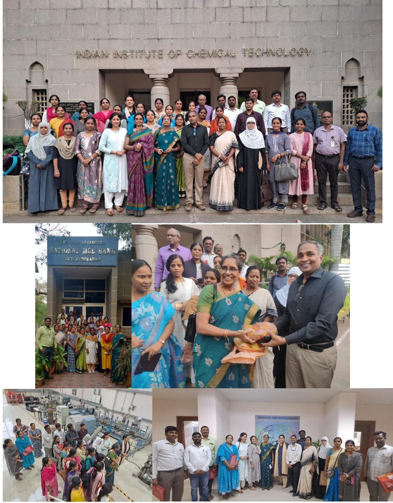
Visit to IICT Hyderabad